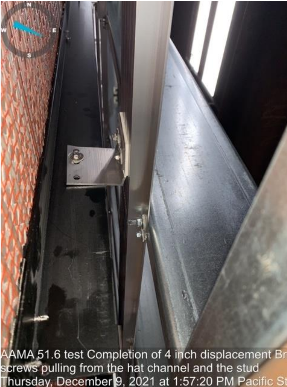
AAMA 51.6 test Completion of 4 inch displacement Bro screws pulling from the hat channel and the stud Thursday, December 9, 2021 at 1:57:20 PM Pacific Sta