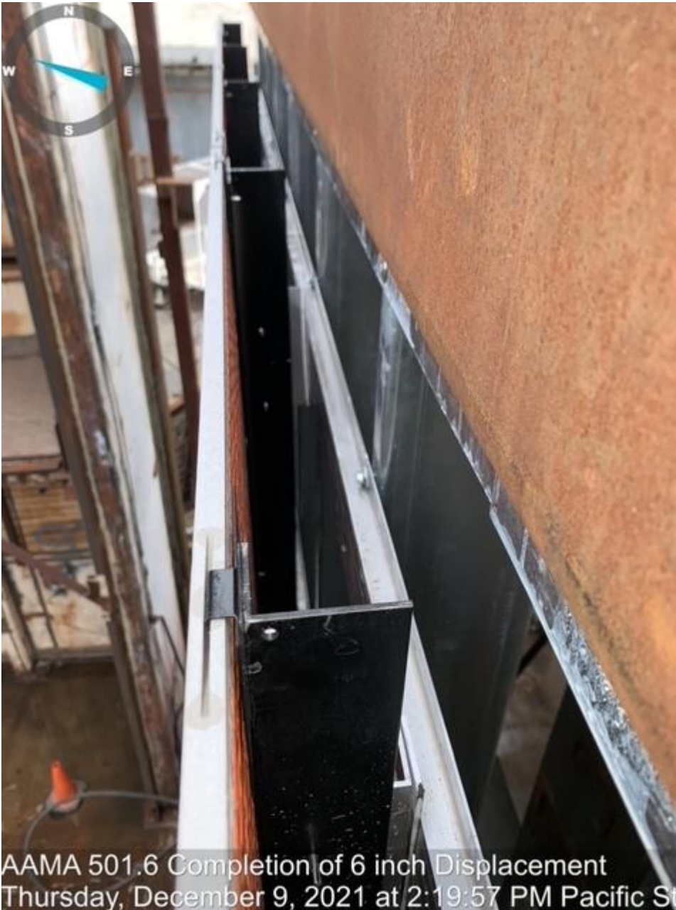
AAMA 501.6 Completion of 6 inch Displacement Thursday, December 9, 2021 at 2:19:57 PM Pacific Sta