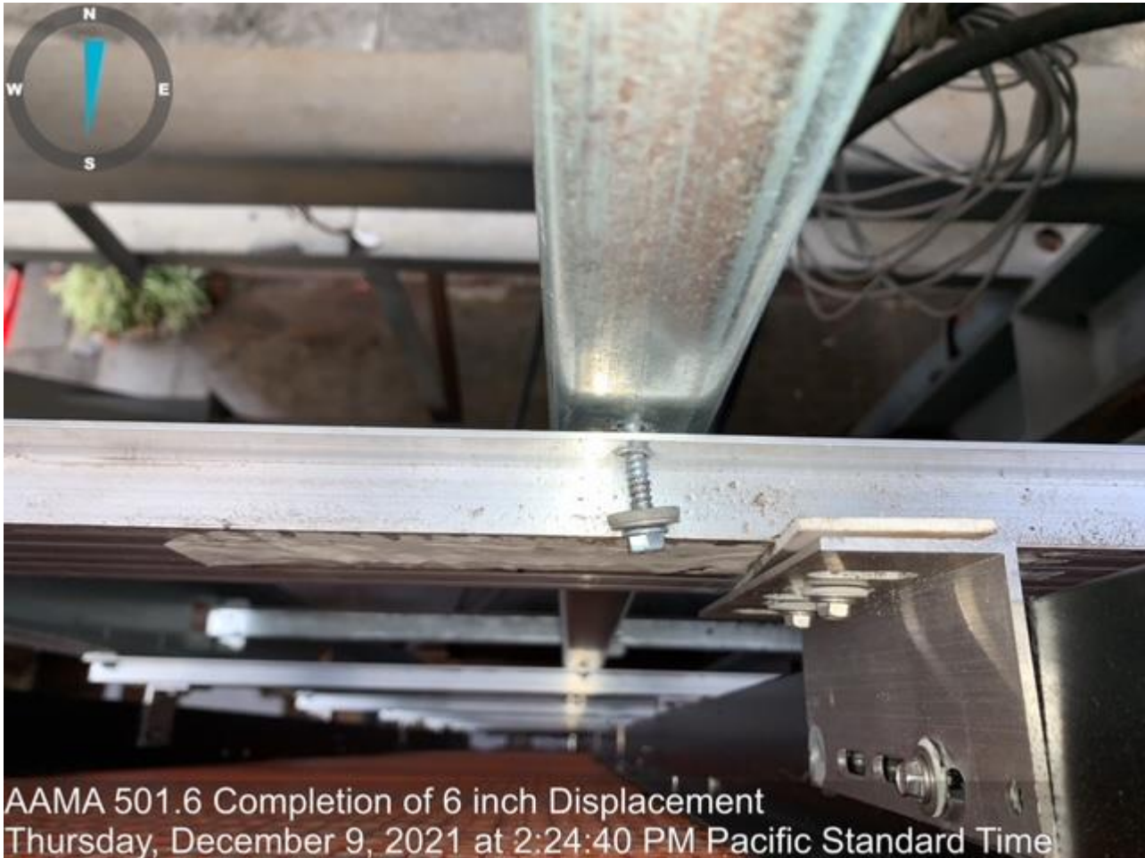
AAMA 501.6 Completion of 6 inch Displacement Thursday, December 9, 2021 at 2:24:40 PM Pacific Standard Time