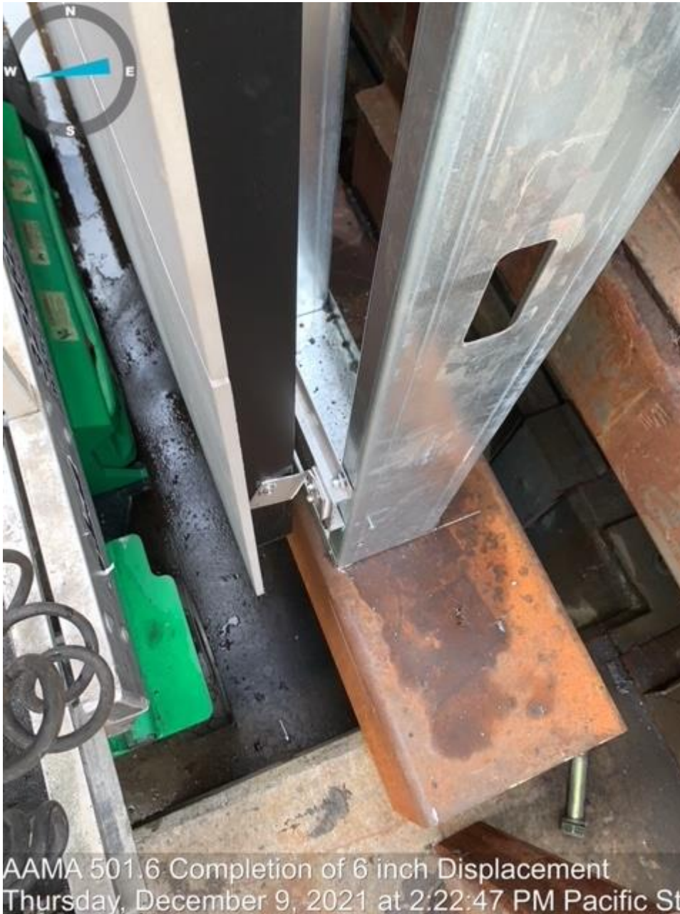
AAMA 501.6 Completion of 6 inch Displacement Thursday, December 9, 2021 at 2:22:47 PM Pacific Sta