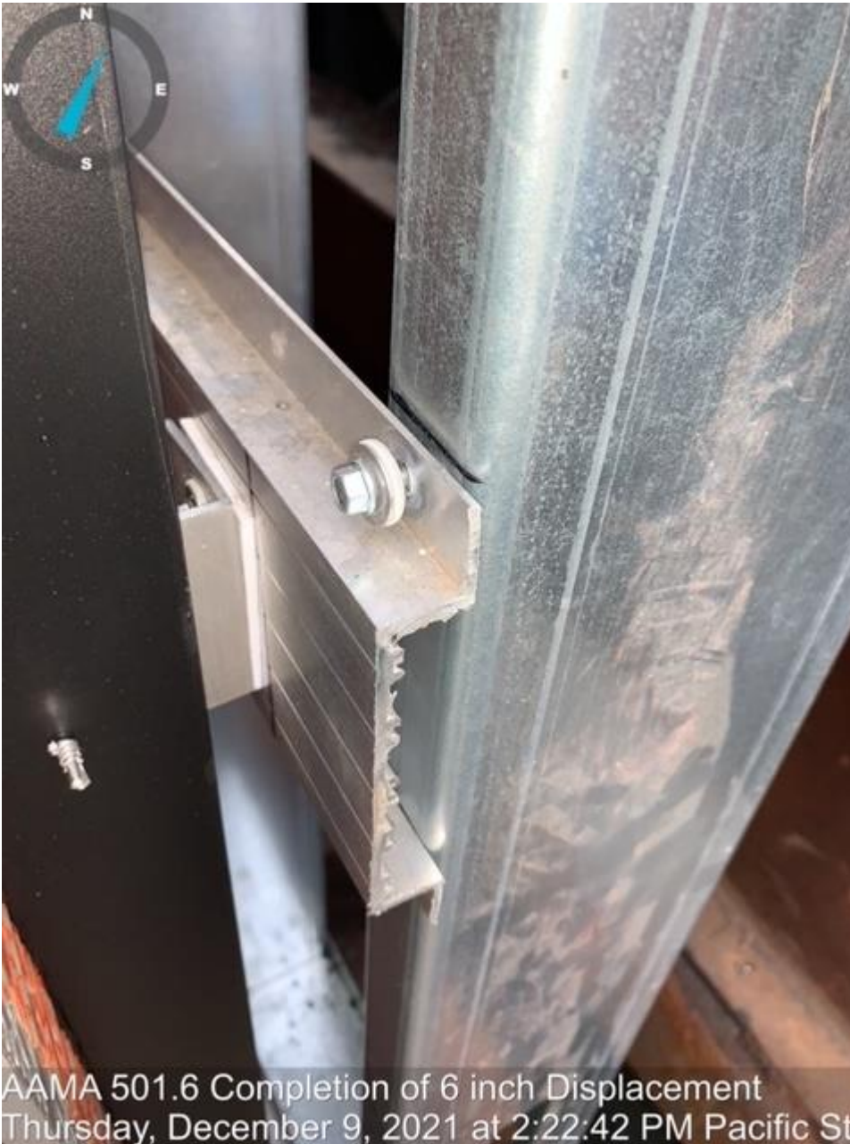
AAMA 501.6 Completion of 6 inch Displacement Thursday, December 9, 2021 at 2:22:42 PM Pacific Sta