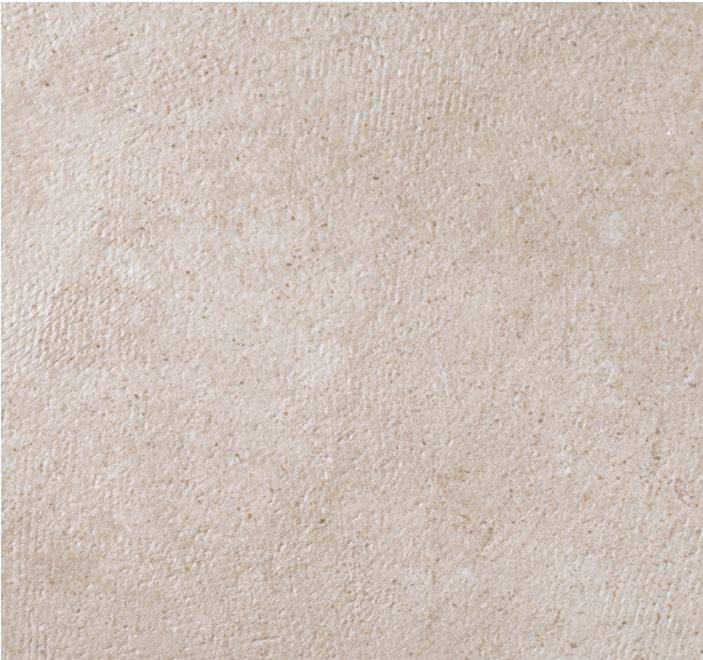
Porcelain DOVER ARENA