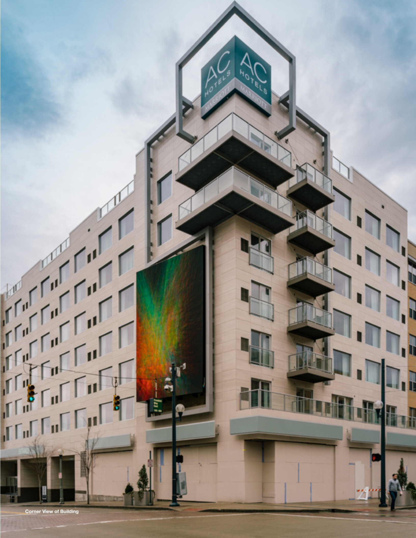
Corner View of Building