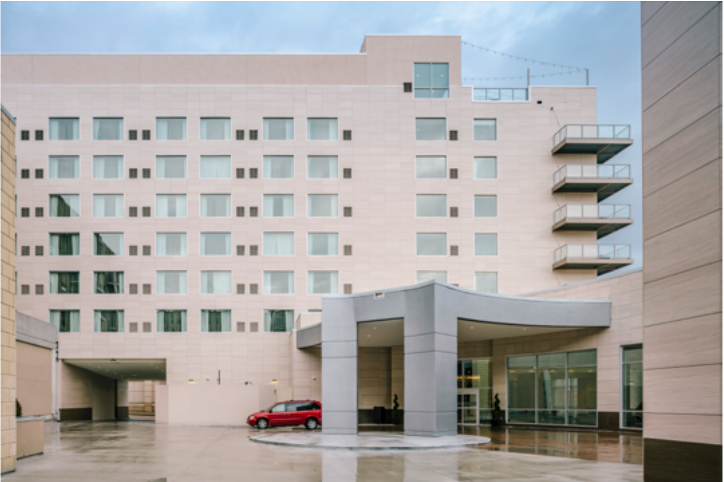
Porcelain Cladding at Building entrance