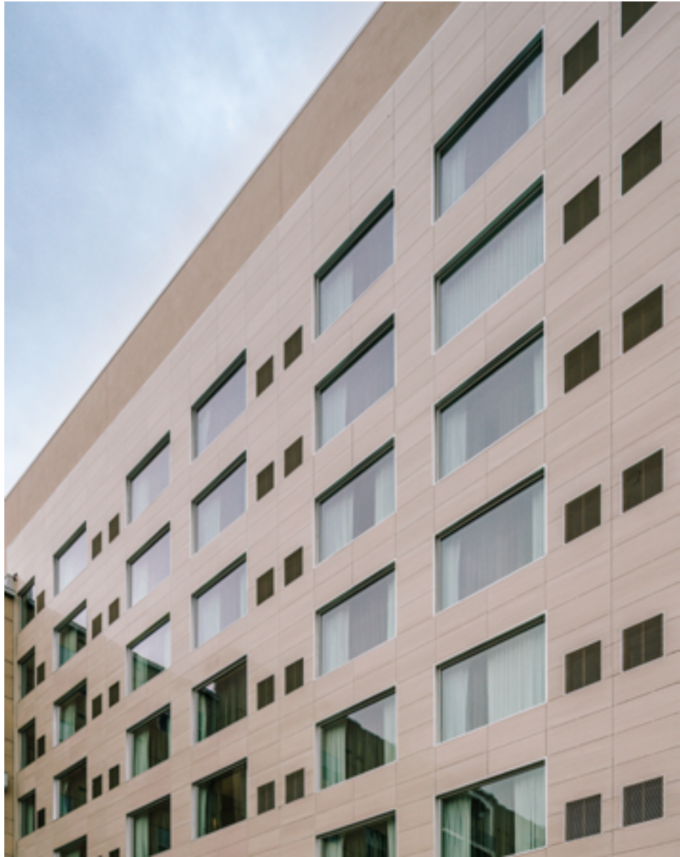
Encounter of rounded and flat cladding