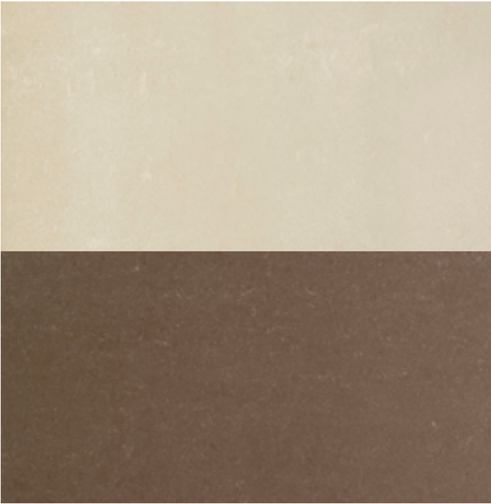
Porcelain 1CINCINNATI MOKA