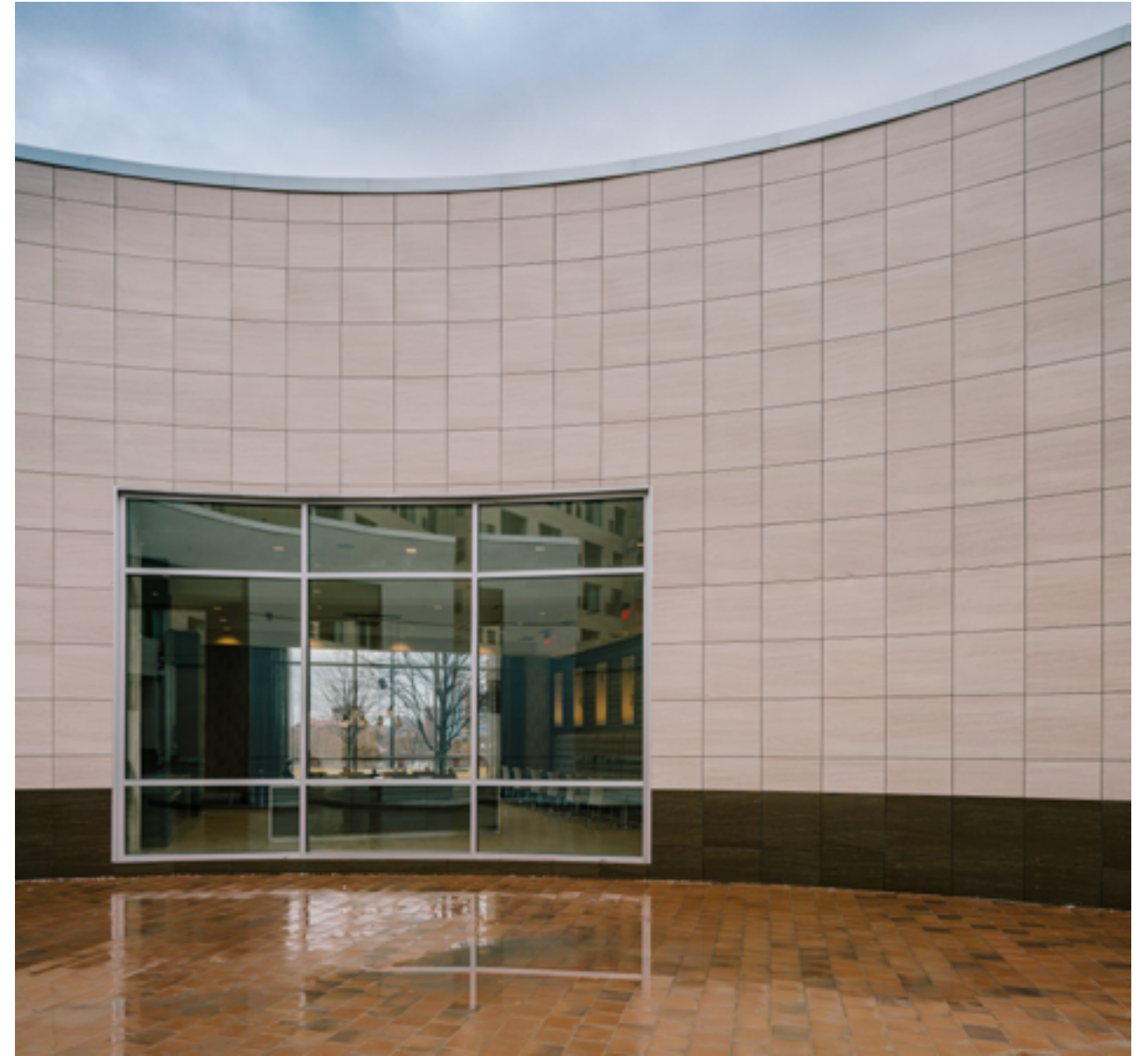
Rounded cladding work coordinated with fenestration