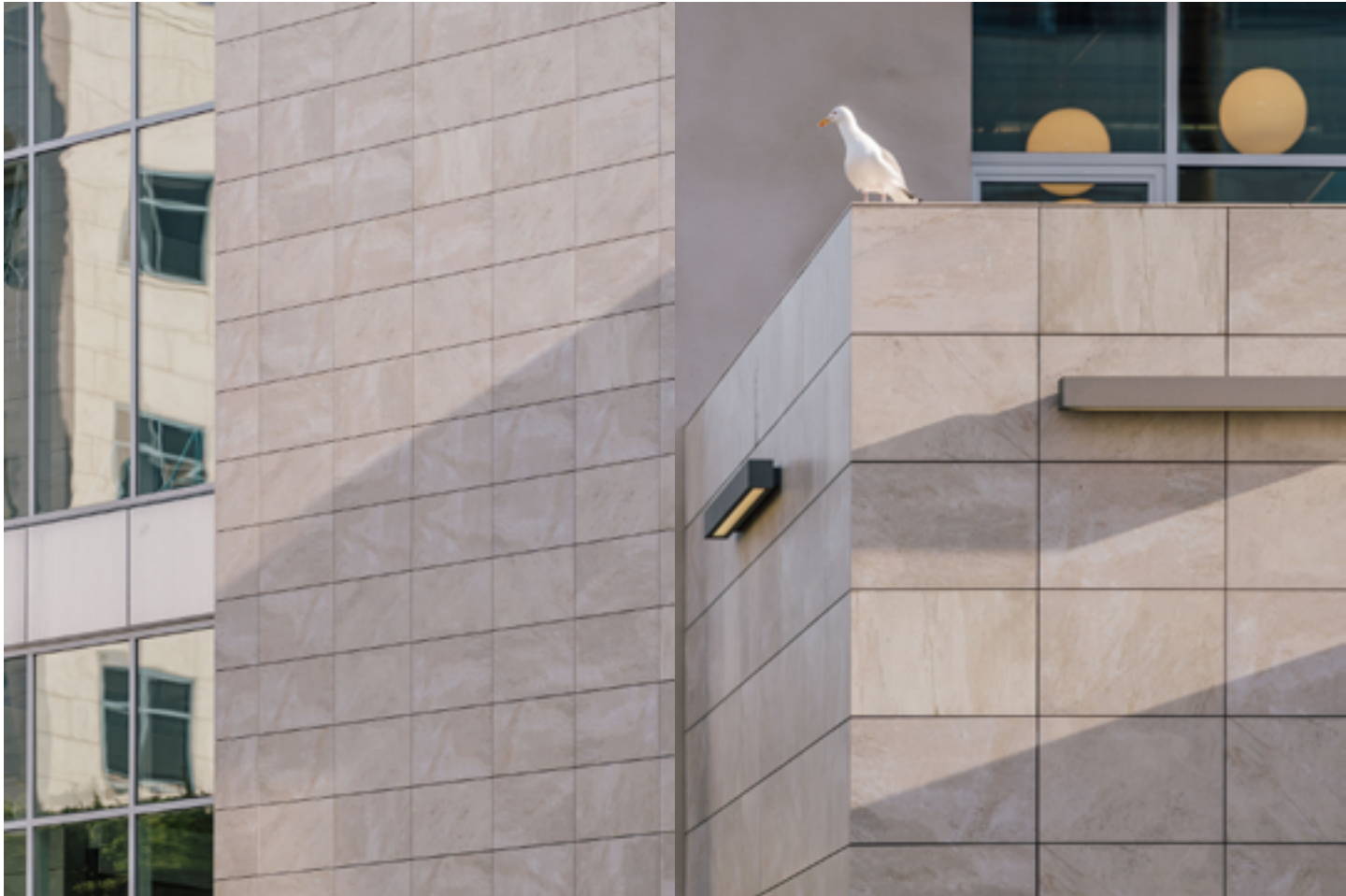
Solid porcelain wall at glass tower