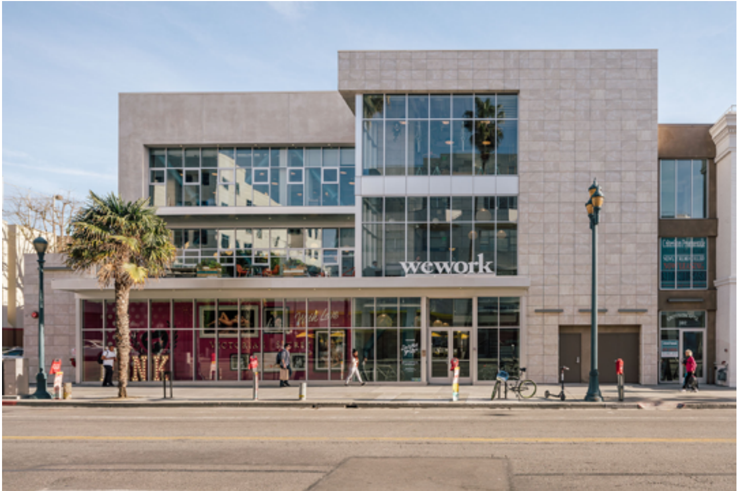
Frontal view with textured porcelain panels cladding