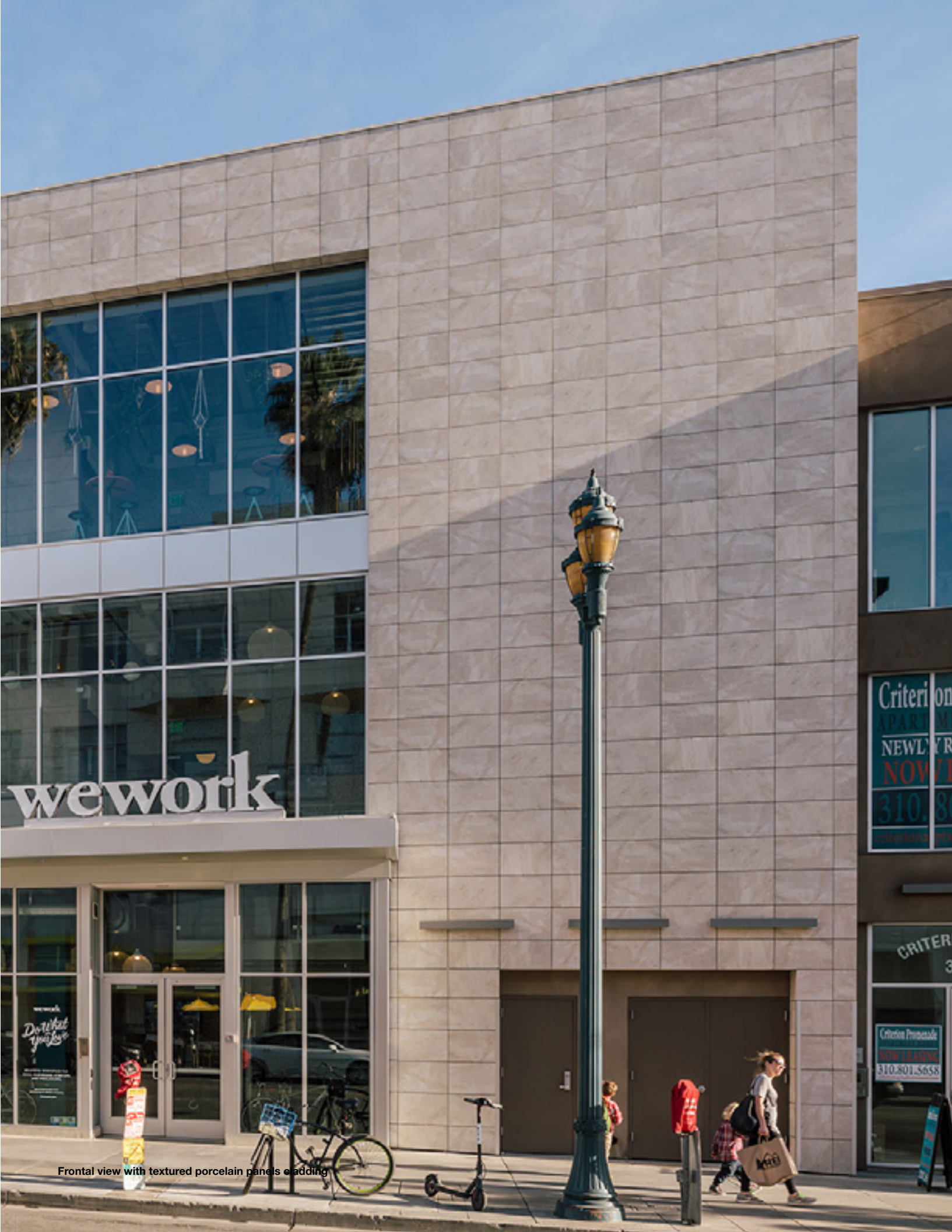
Frontal view with textured porcelain panels cladding