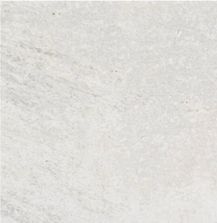
Porcelain ARIZONA CALIZA