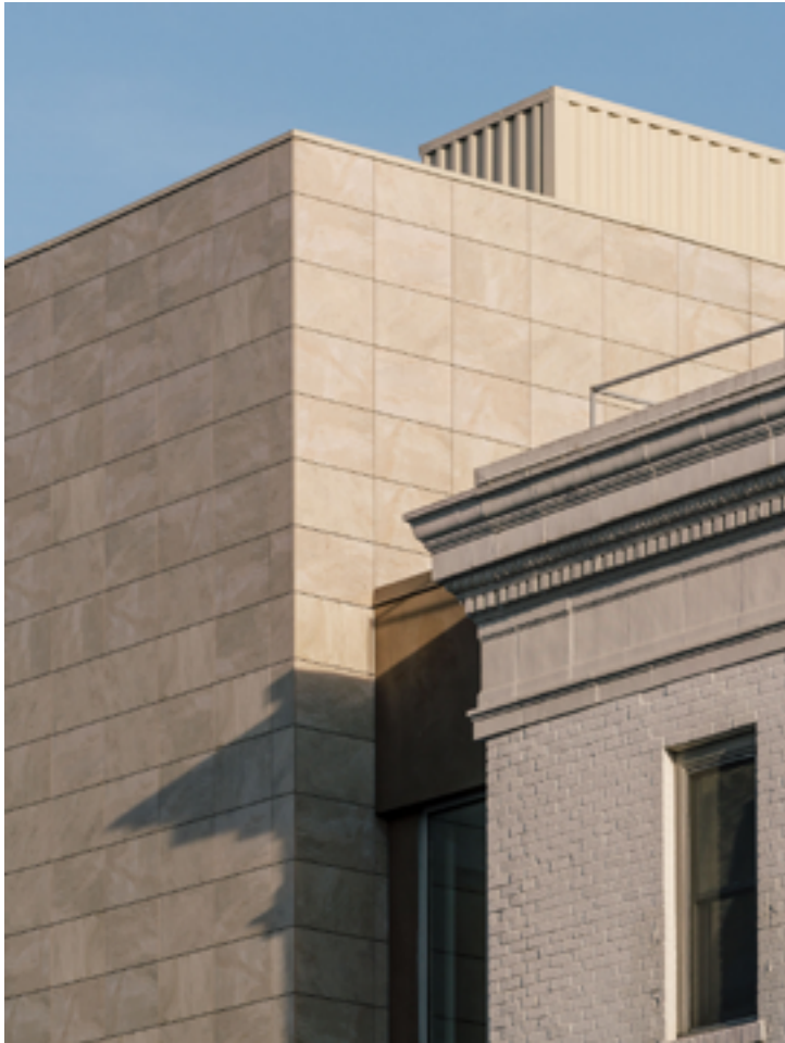
Integration of the old and new with our textured porcelain cladding