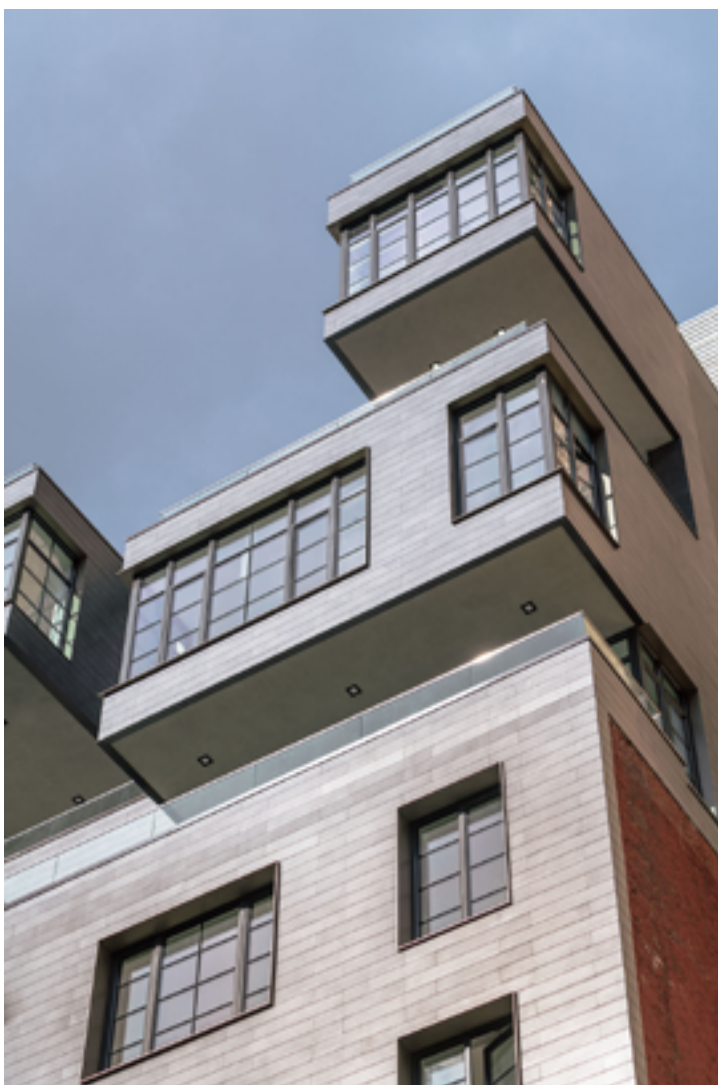
Porcelain cladding building retrofit