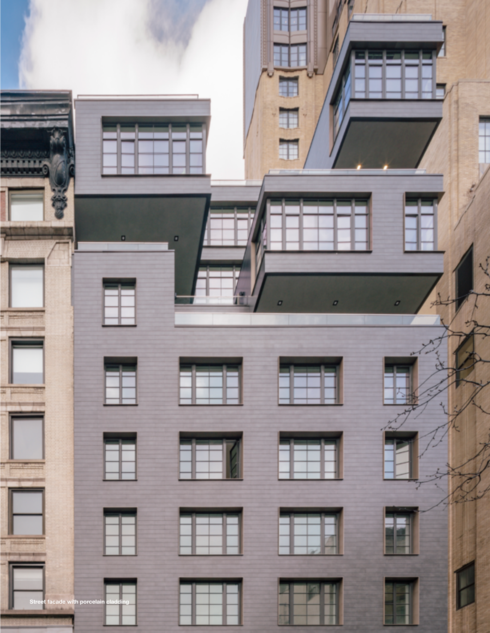
Street facade with porcelain cladding