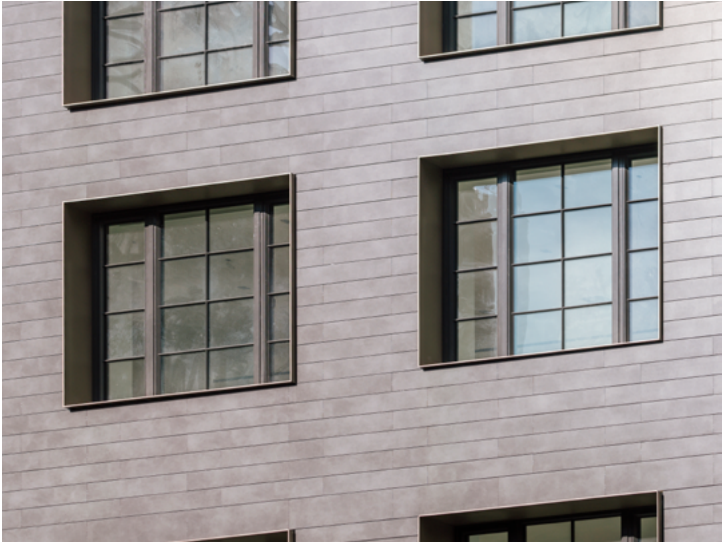
Metal window trim at porcelain facade