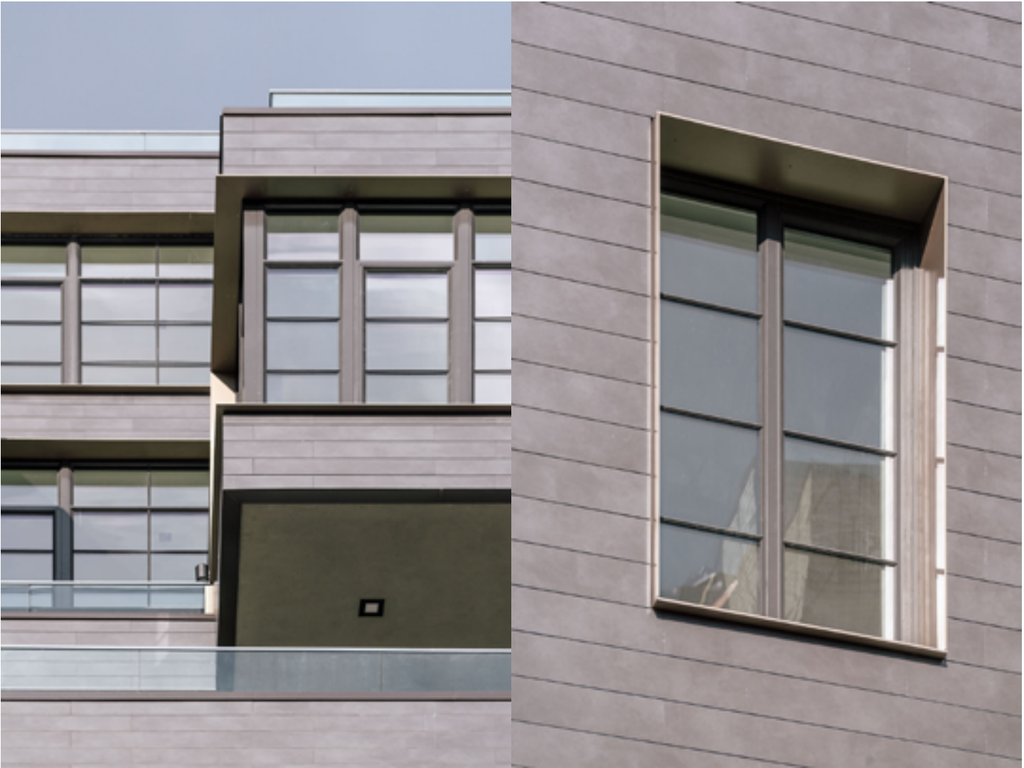
Metal trim at porcelain cladding facade