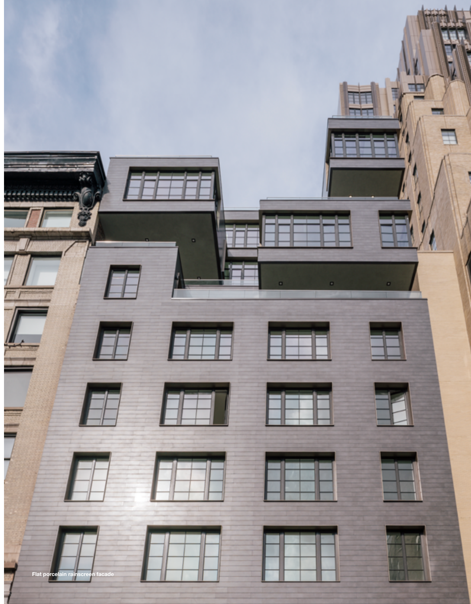
Flat porcelain rainscreen facade