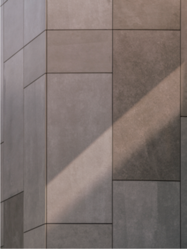
Fitler Nine Typical corner detail at porcelain cladding