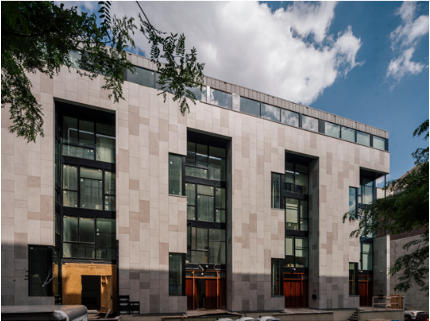
Main large format porcelain panel facade