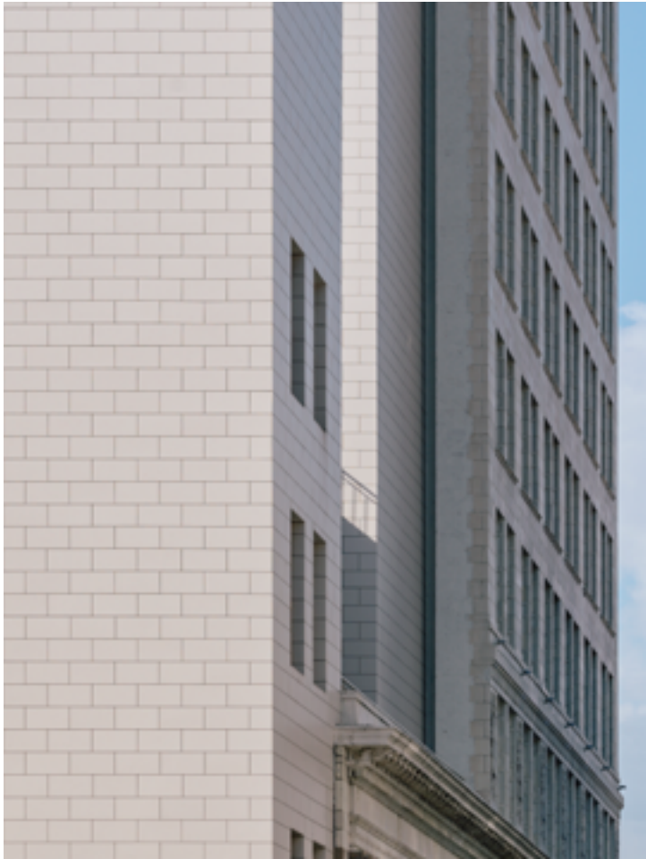
Mimetization between original Stone Veneer and new Porcelain Cladding