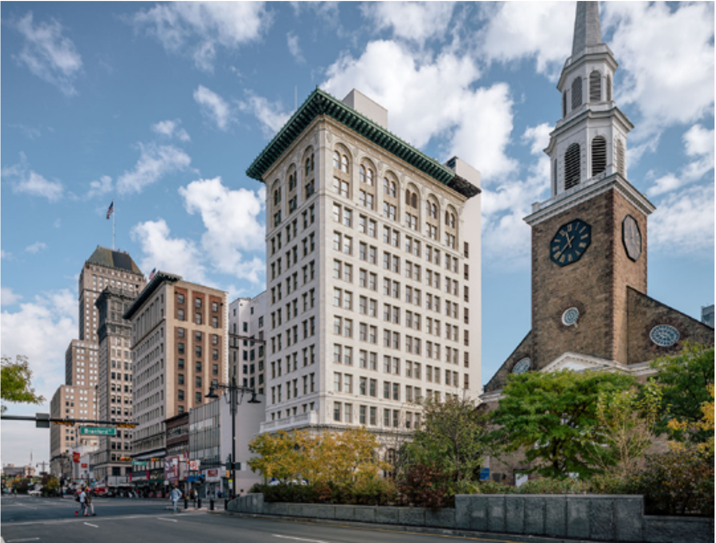
Color and module coordination of Porcelain Cladding and original Stone Veneer