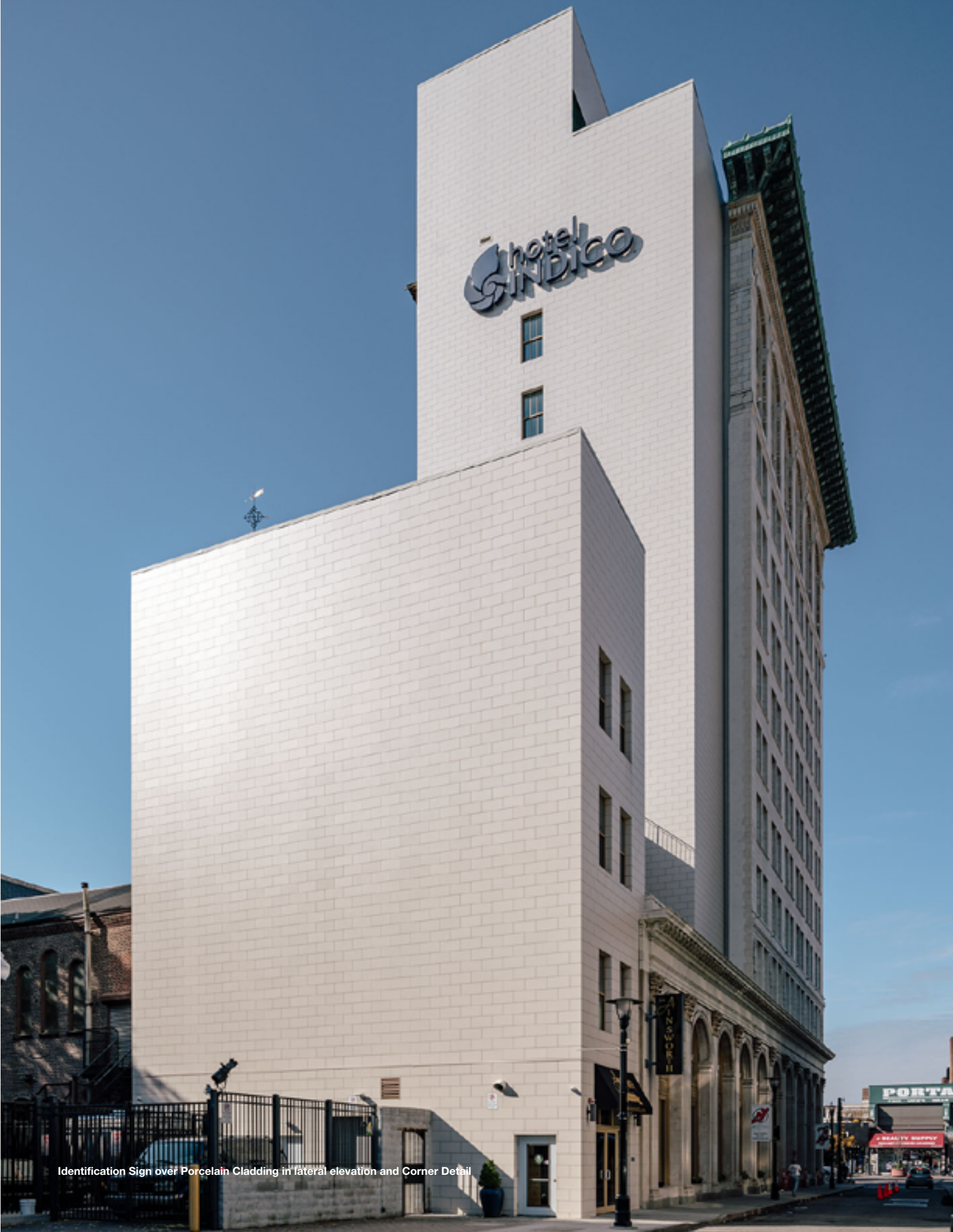
Identification Sign over Porcelain Cladding in lateral elevation and Corner Detail