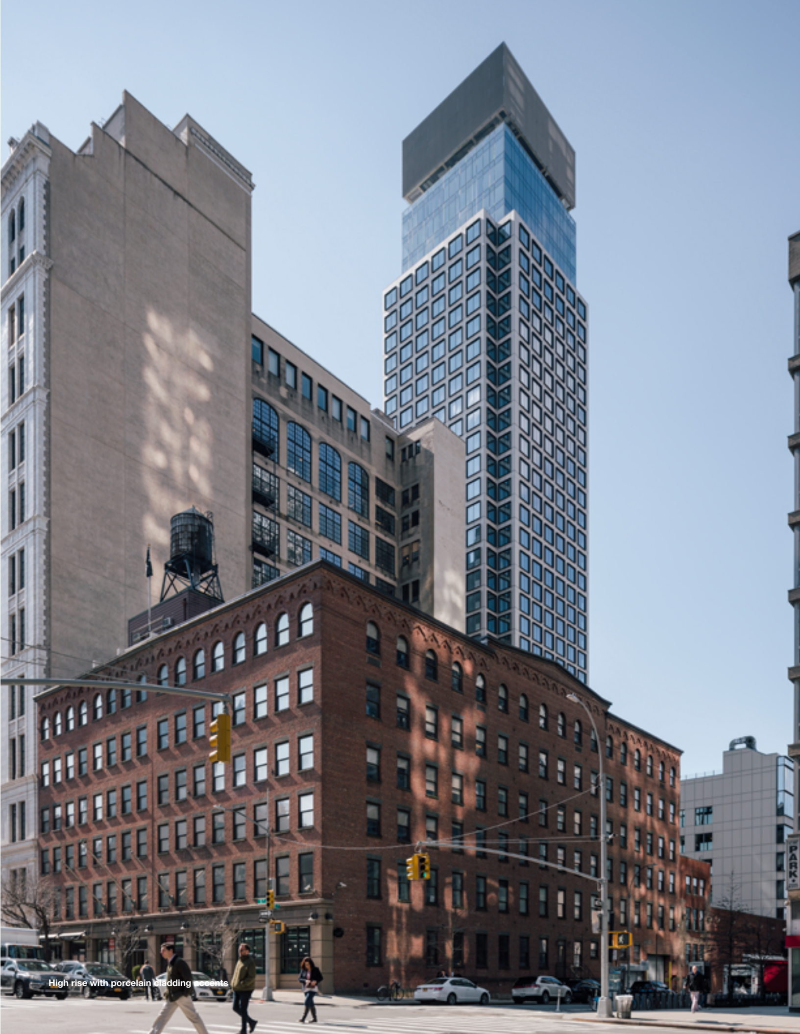
High rise with porcelain cladding accents