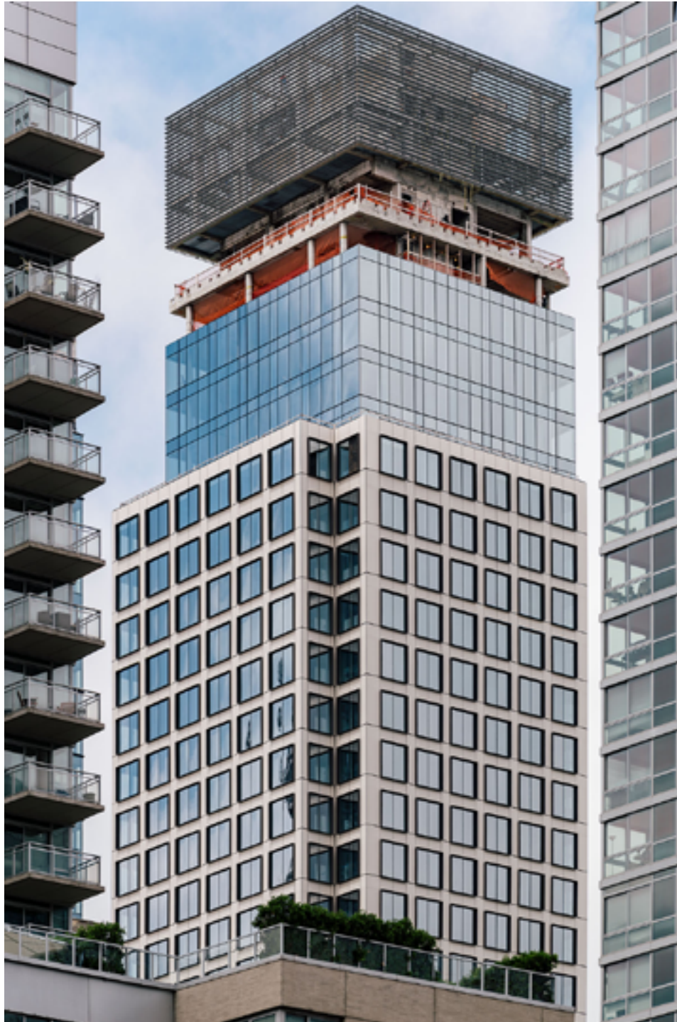
Multifamily tower with ventilated porcelain rainscreen system