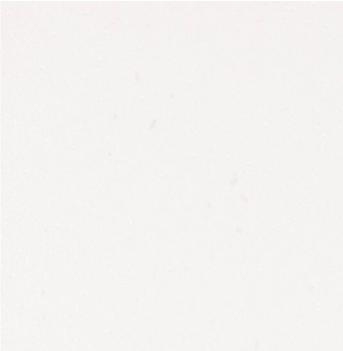
Porcelain ARK WHITE BRIGHT