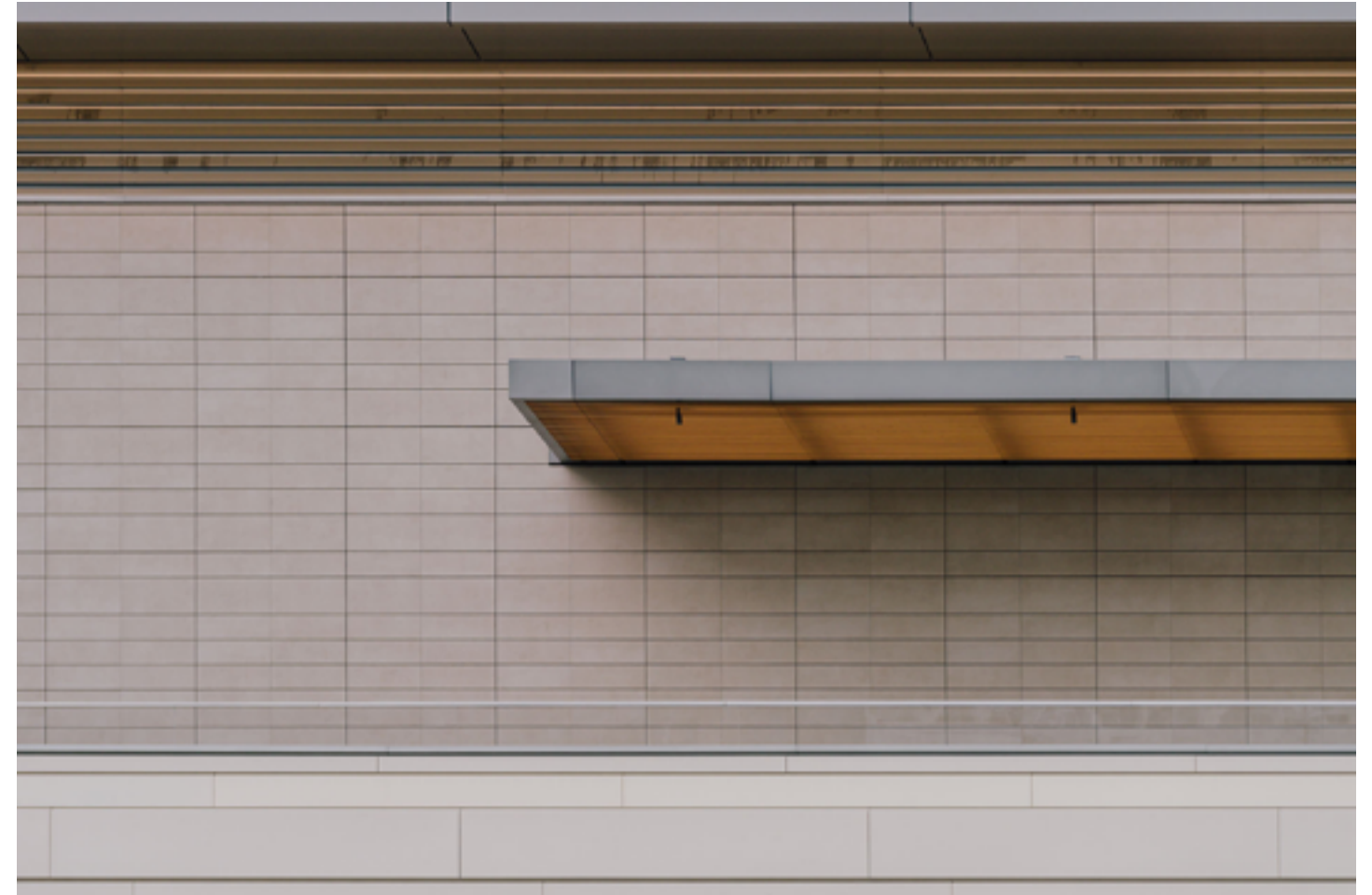
Porcelain Cladding facade modulation