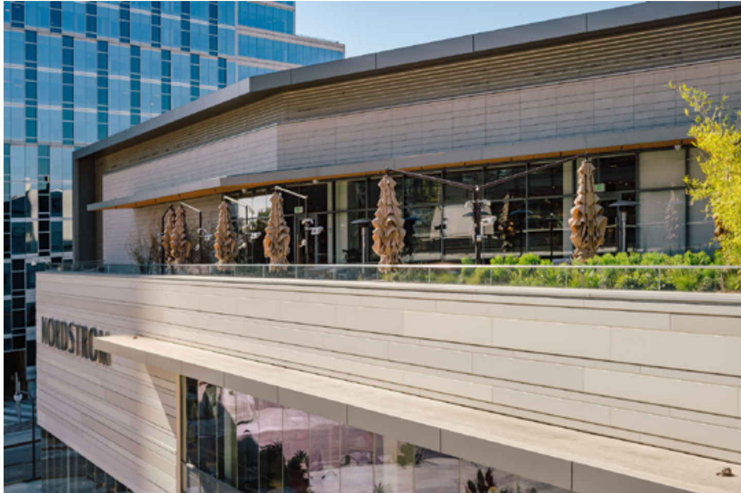
Color coordination between cladding and other facade materials