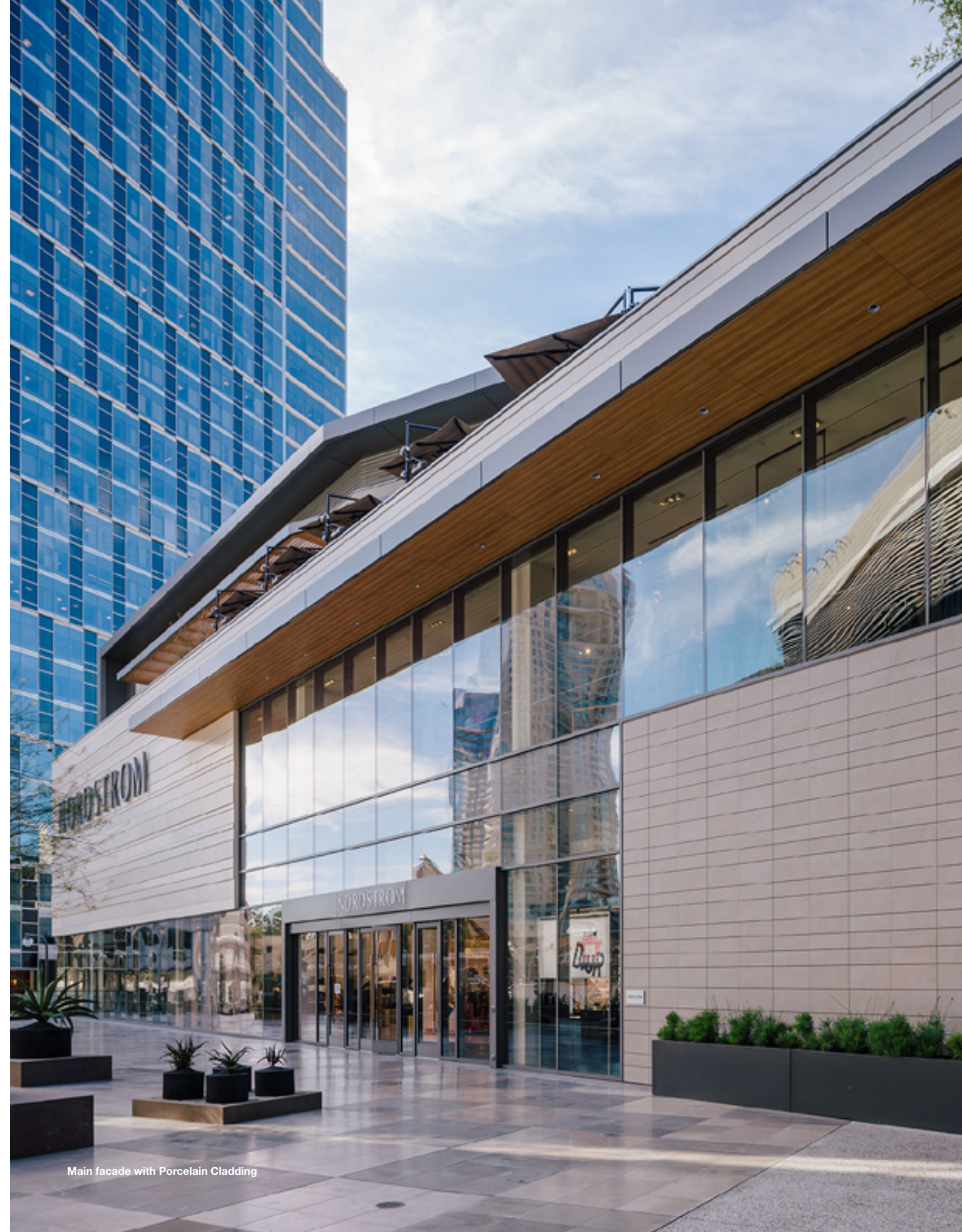
Main facade with Porcelain Cladding