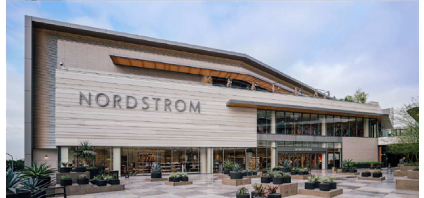
Main facade with Porcelain Cladding