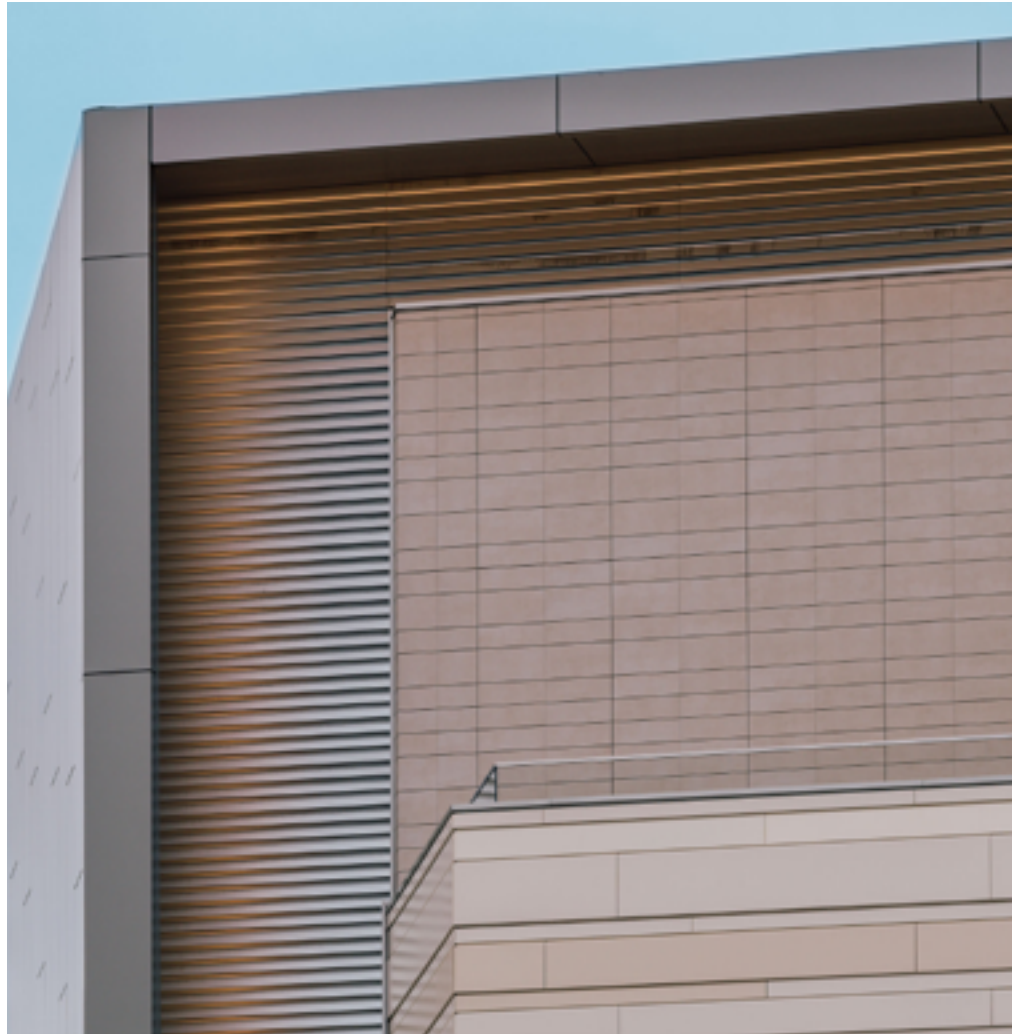
Close view of Porcelain Cladding in combination with other materials