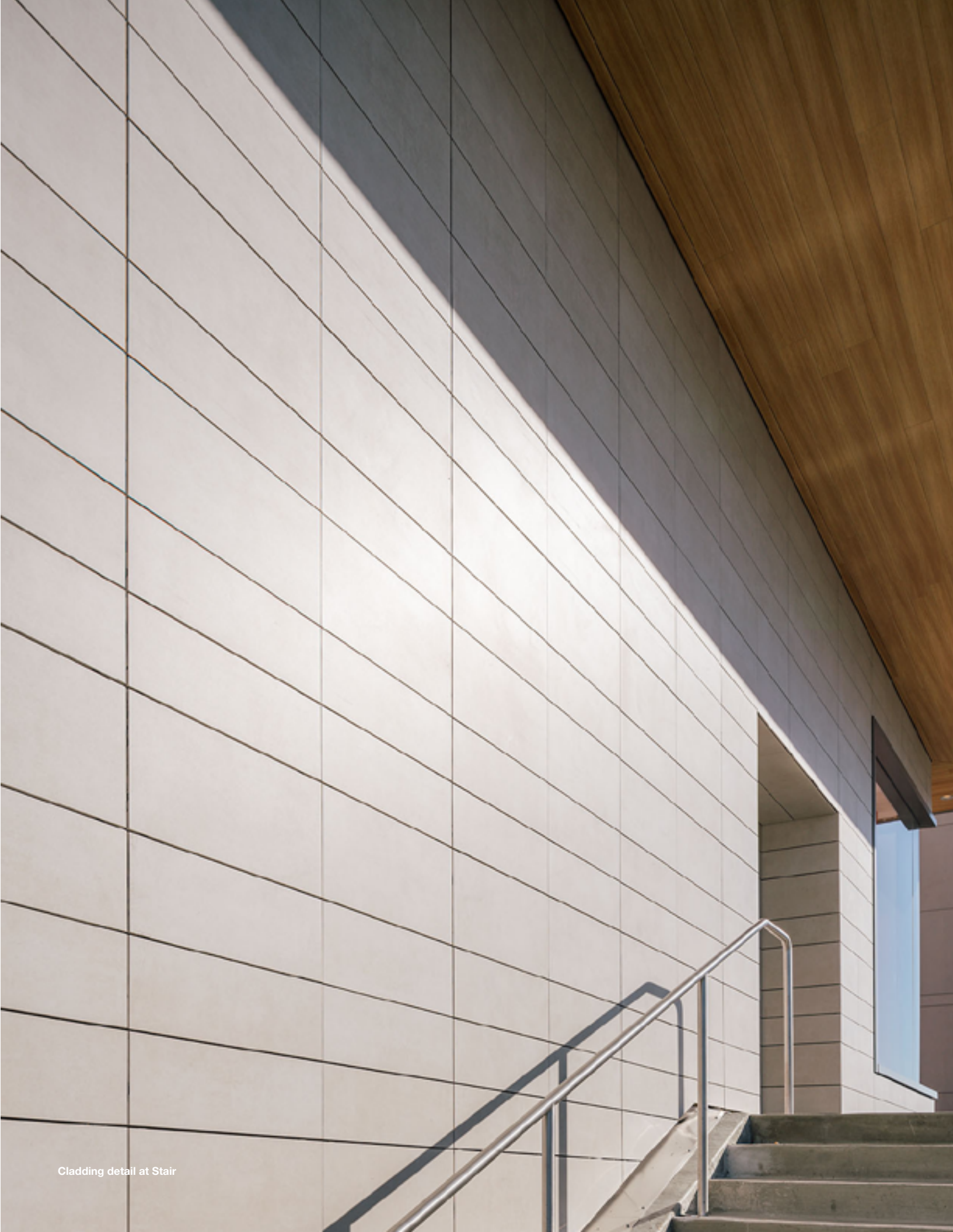
Cladding detail at Stair