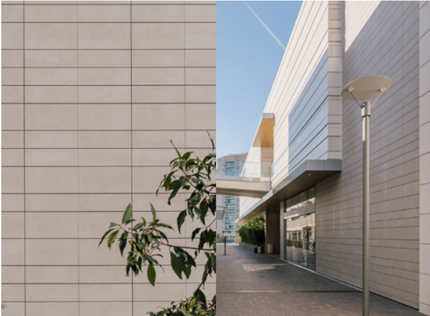
Porcelain Cladding applied in coordination with other facade materials