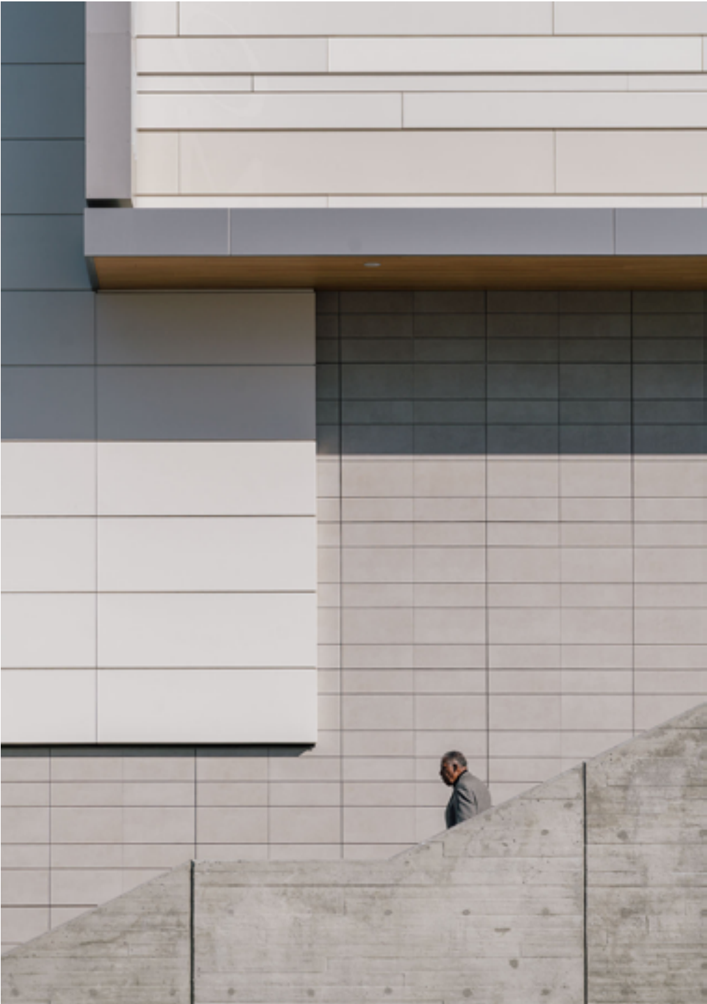
Detail of Porcelain Panel Modulation