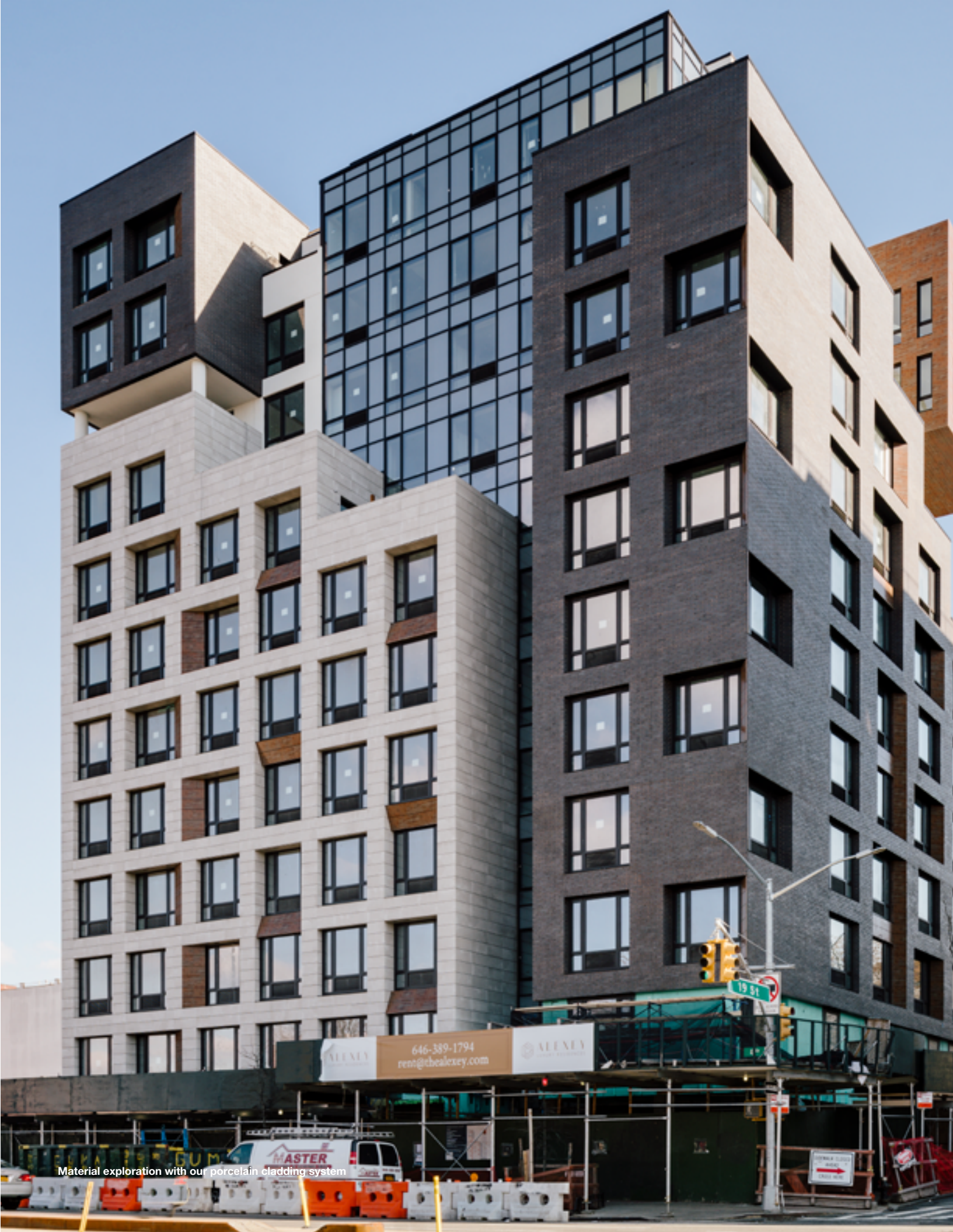
Material exploration with our porcelain cladding system