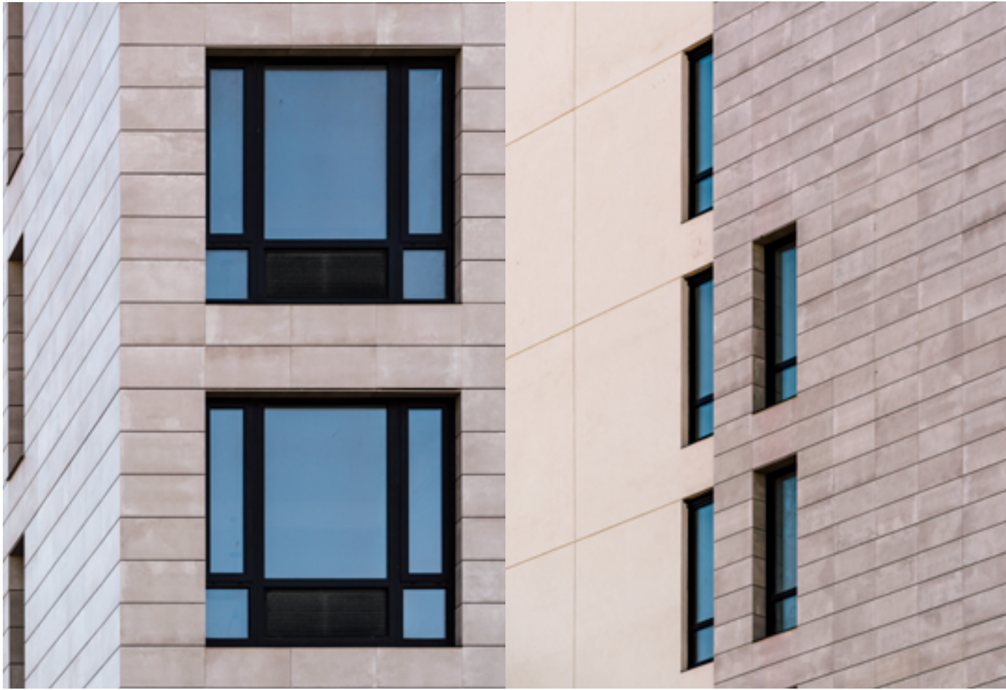
Metallic and textured porcelain cladding