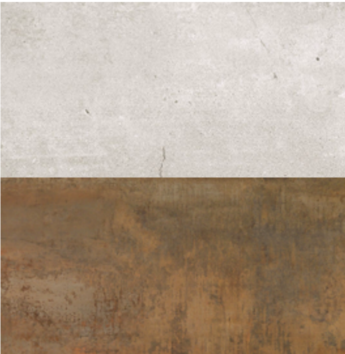
Porcelain TRIBECA CALIZA