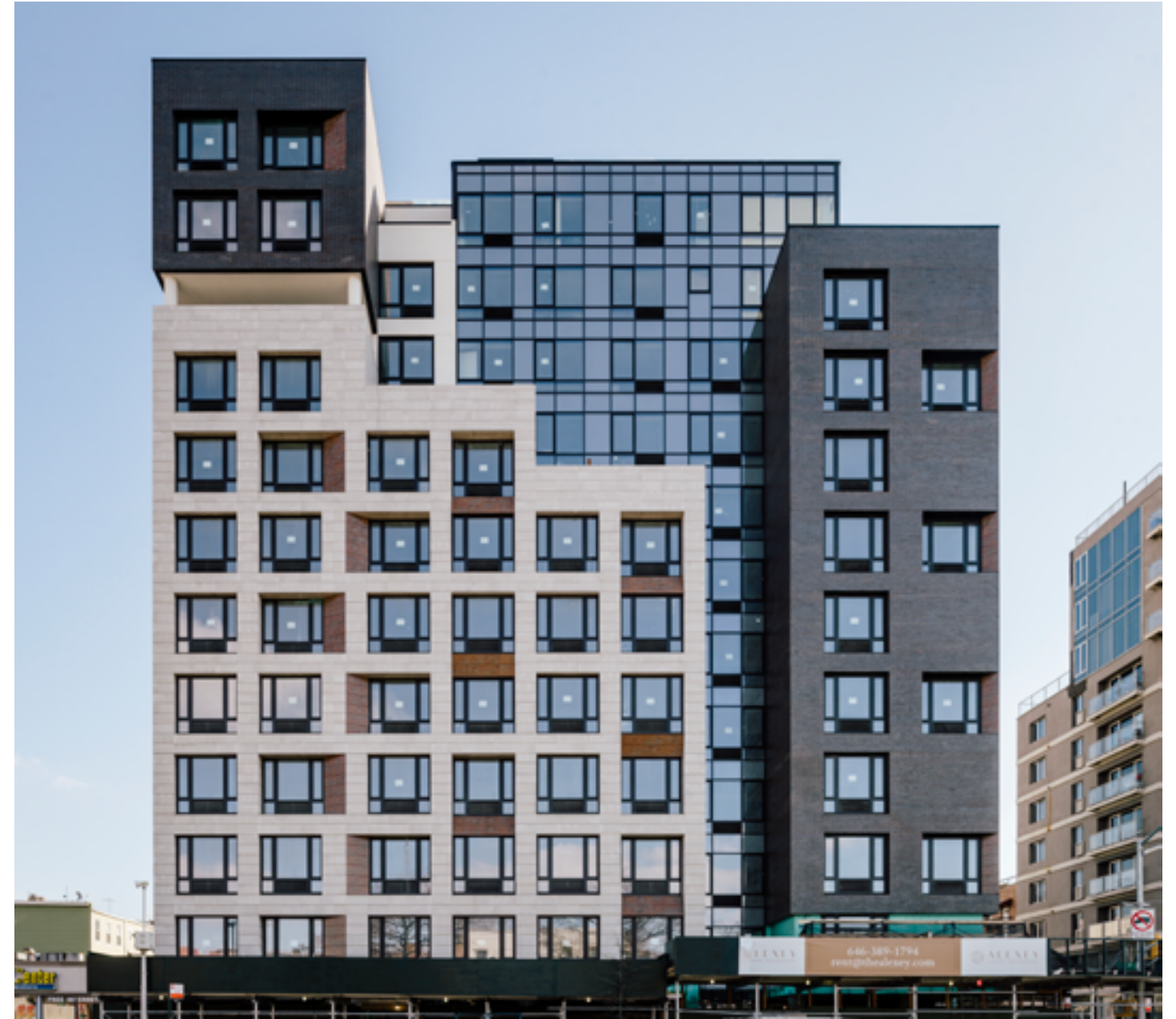
Main porcelain panel facade system