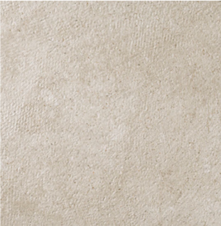
Porcelain DOVER ARENA