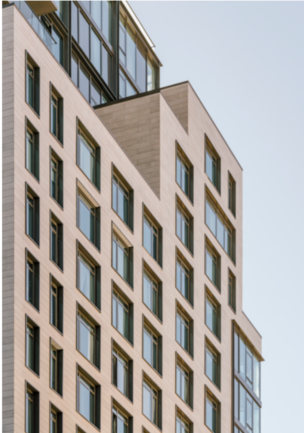
Opaque wall with porcelain cladding