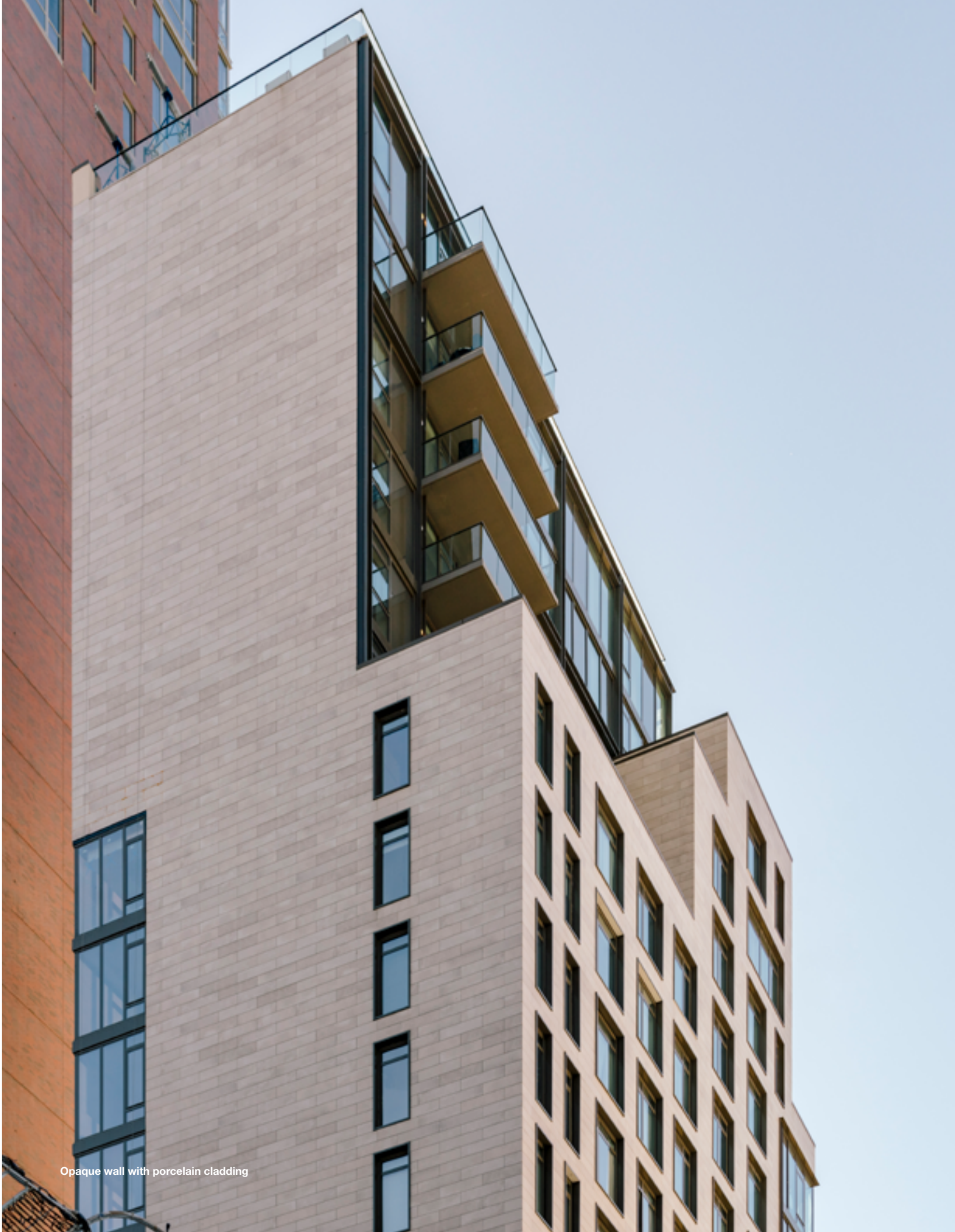
Opaque wall with porcelain cladding