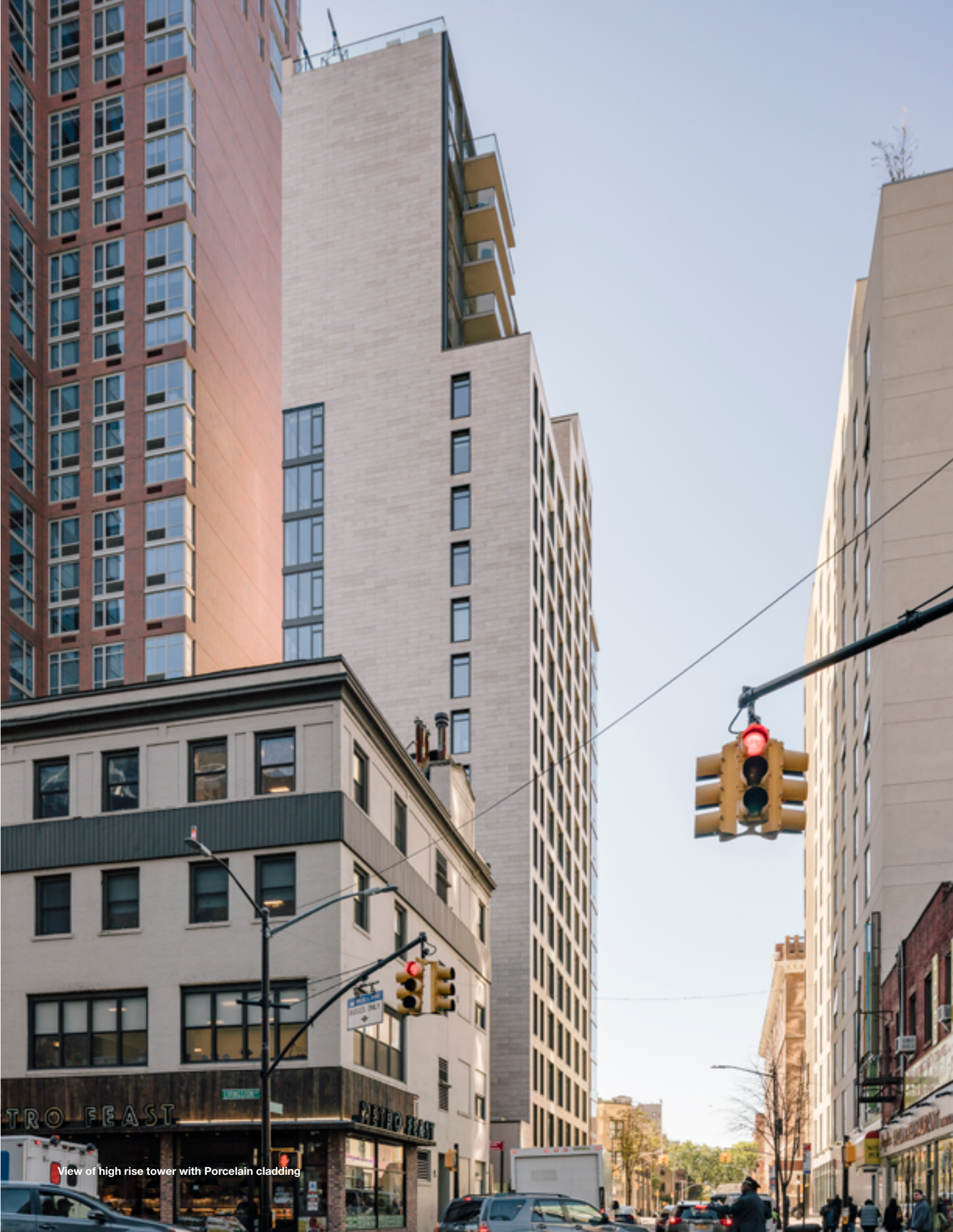
View of high rise tower with Porcelain cladding