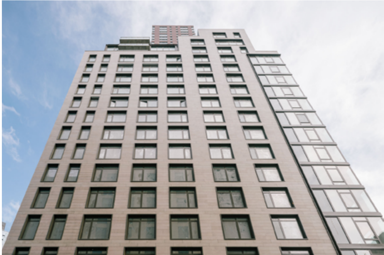
Front view of tower with Porcelain cladding ventilated facade