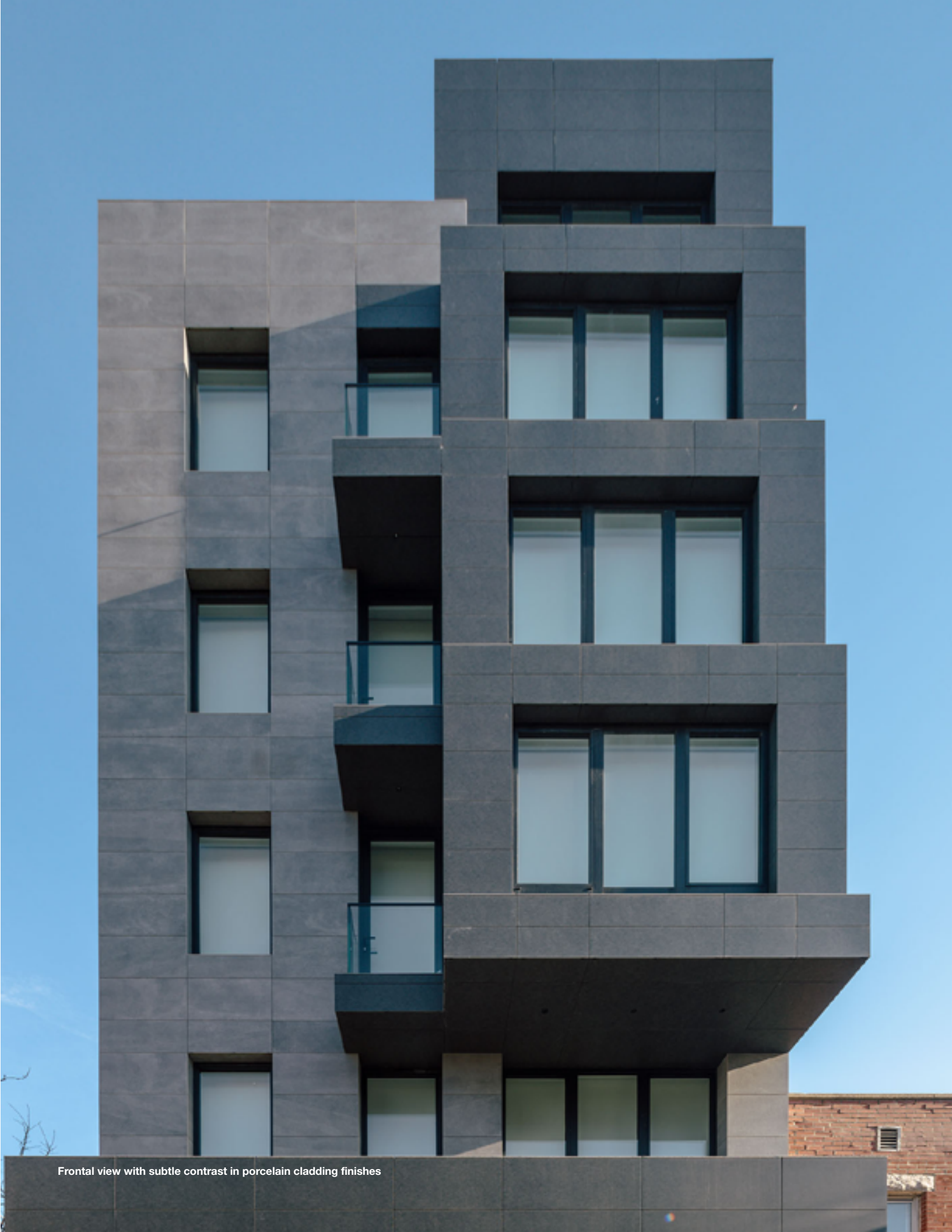
Frontal view with subtle contrast in porcelain cladding finishes