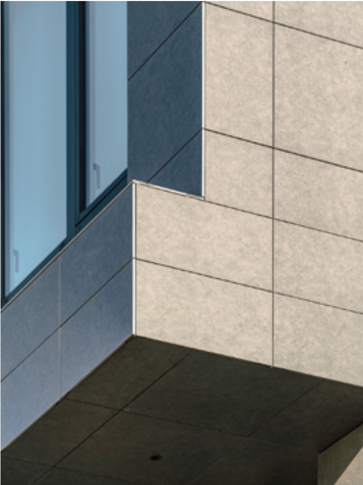
Typical porcelain cladding window returns and Porcelain cladding soffit